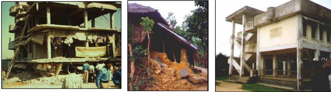
Fig.2: (a) Collapsed RC Frame building in Chittagong city (Nov.1997 M=6.0 earthquake 100 km away) (b) Partially collapsed mudwalled house in Moheshkhali Island (July 1999 M=5.1 earthquake) (c) Multipurpose Cyclone Shelter in Moheshkhali Island that sustained damage in its column (July 1999)